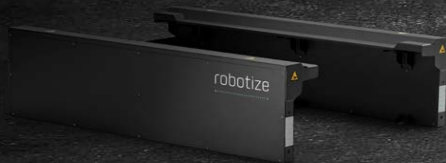
GOPAL PALLET STATIONS

SIMPLE INTERFACE AND DATA REPRESENTATION GoControl captures and represents all system data (robot position on map, distance driven, pallets moved etc.). GoControl also interfaces with your ERP/WMS system.